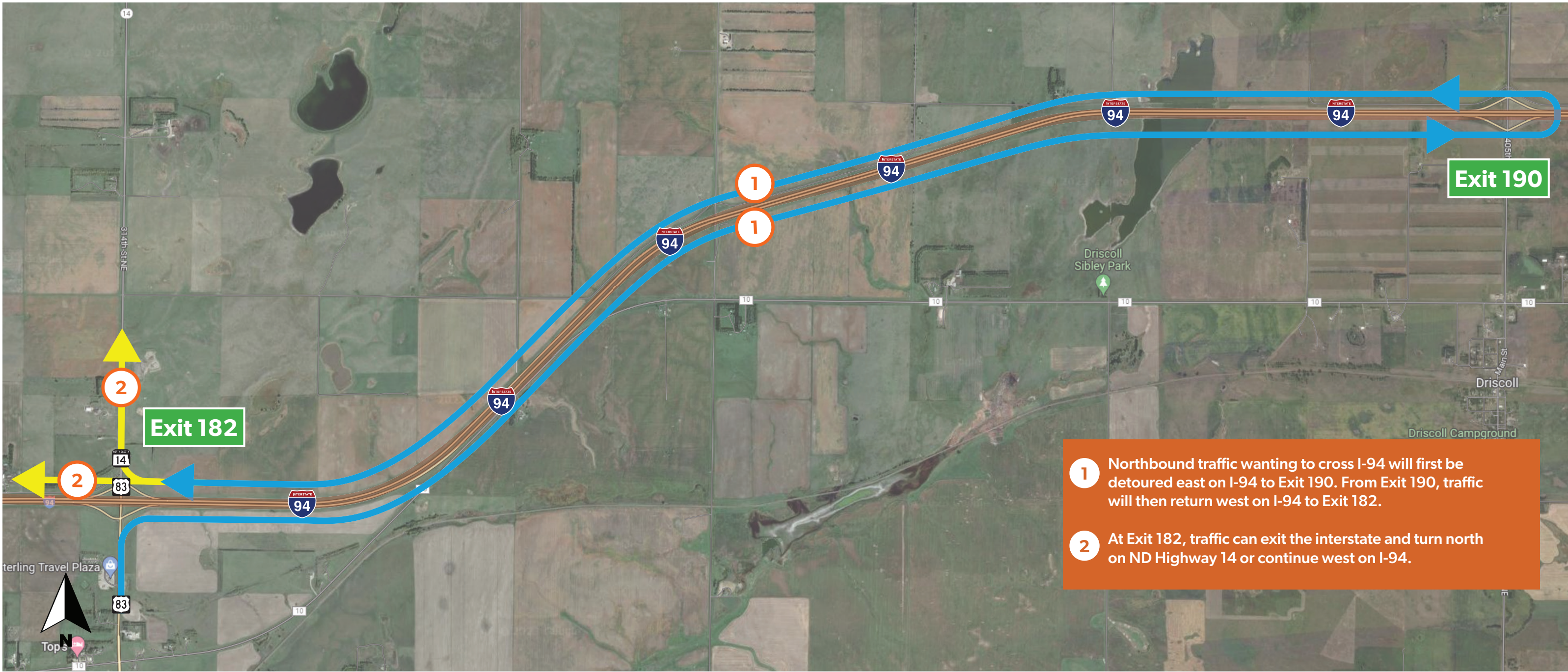
Detour plan for US Highway 83 crossroad traffic (northbound)