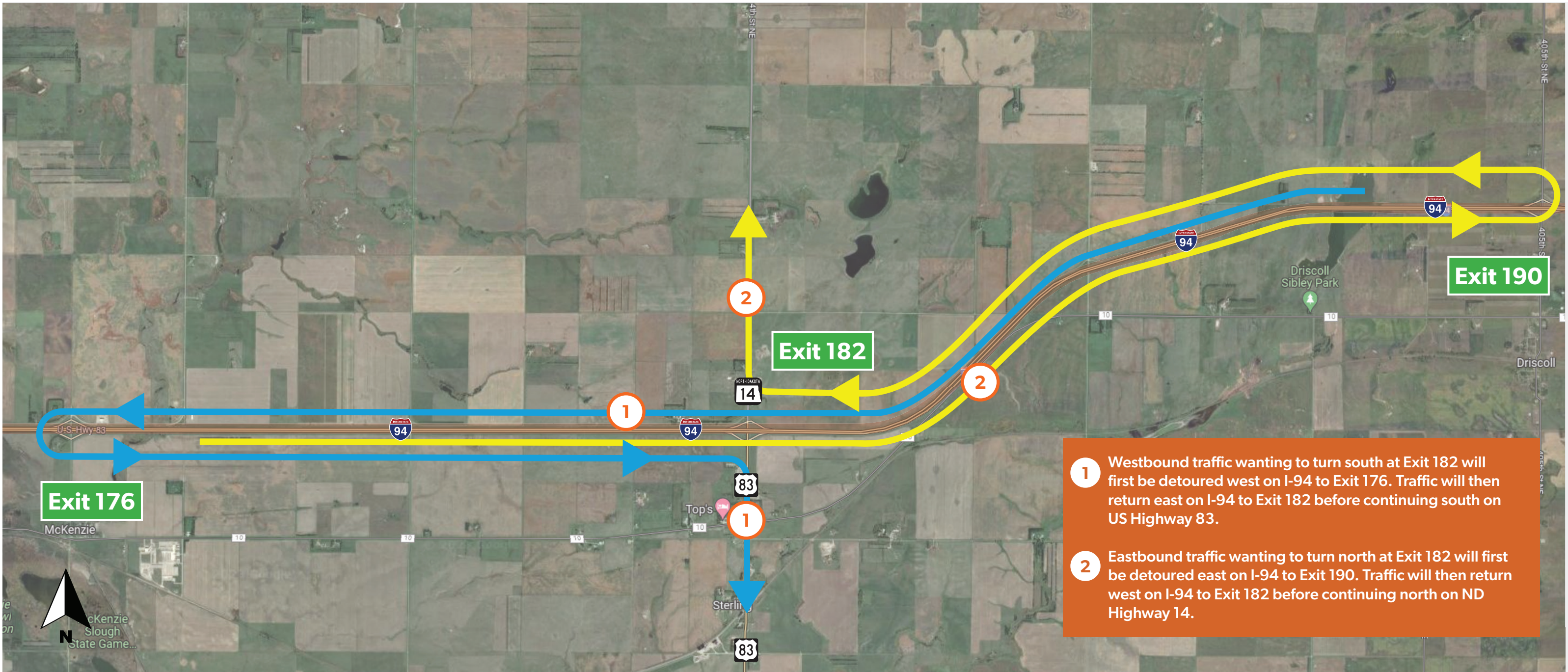
Detour plan for traffic exiting interstate at Exit 182