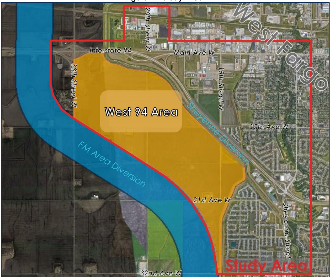
Figure 1 – Study Area